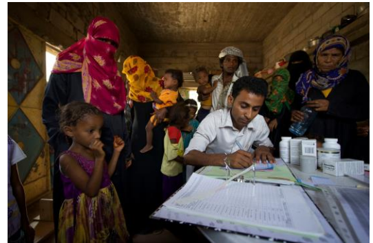
A medical worker registering young patients in Hudaydah.

Due to shifts in the areas of control in several regions, access negotiations are becoming increasingly cumbersome for partners, often resulting in delays in delivery of assistance. With the dynamically evolving situation of cholera and the risk of famine in 95 districts, collecting response information at district level is becoming ever more important. Gathering and analysing needs and response data at the district level will allow humanitarian partners to deliver a more targeted response, by accurately identifying and targeting underserved areas. The next collective review and analysis of evolving needs will be carried out in October, when partners are producing the 2018 Humanitarian Needs Overview that will guide response planning for the coming year.