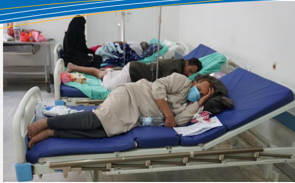
Cholera patients at a hospital in Sana'a.